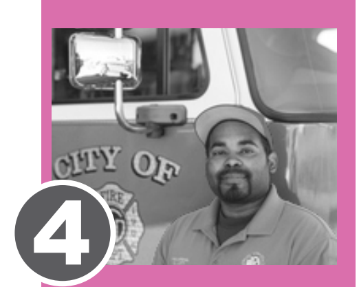
New Fire Marshal