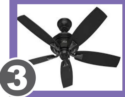
Tips on Keeping Cool This Summer