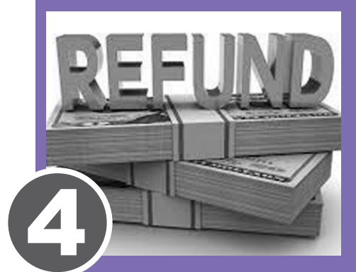
Refunds and Unclaimed Funds