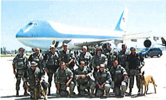
Military & Law Enforcement Training

Using specialized selection testing we are also able to find dogs which have the drives and character traits necessary to perform both detector and patrol functions simultaneously. This, in essence, gives the agency two dogs for the price of one and saves the agency money, as it is possible for the one dog to perform both functions. We have trained many dual-purpose teams across the country and in many of the foreign countries and it has become the preference by most agency administrators.