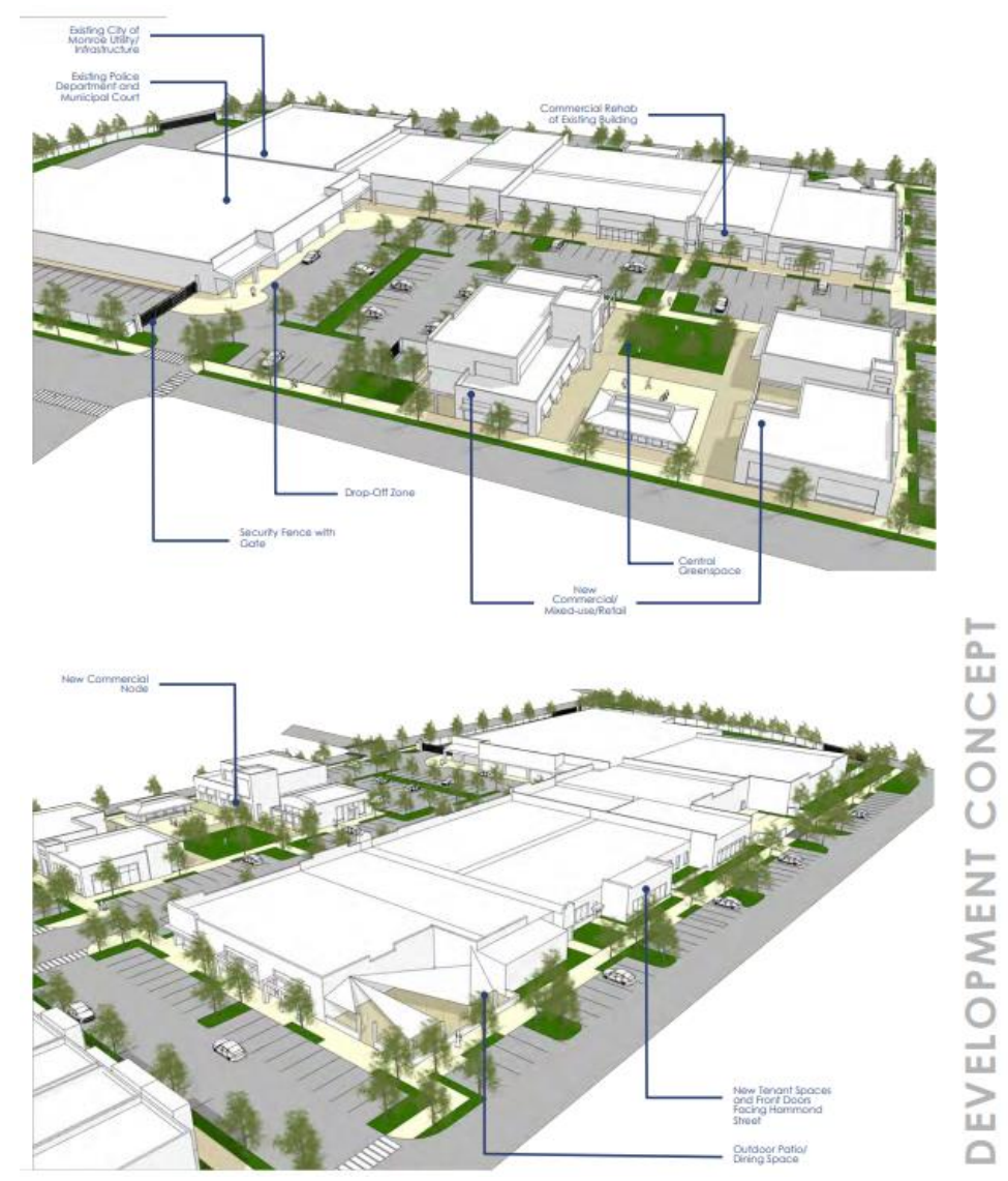
<u>Figure 5</u> : 3-D Site Model. Additional information is contained in the Blaine Station Master Plan included with Attachment A.

The city is distributing this offering directly to a targeted list of developers who we believe possess the experience, financial capacity, and potential interest to undertake a project of the scale expected at this location. We are also distributing it to several area architecture, urban planning and commercial construction firms who may know clients who would be a good fit for this opportunity. However, this list is by no means exhaustive. Other interested parties who did not receive this information directly but are interested and qualified to undertake the Project are strongly encouraged to respond.