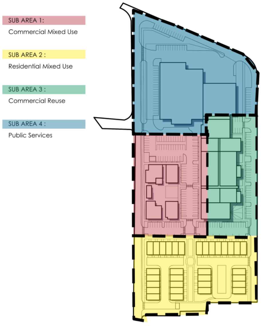
Figure 6 : Sub Area Map. This map shows the potential to subdivide the portion of the site not retained by the City into three distinct sub areas, consistent with their intended future uses.