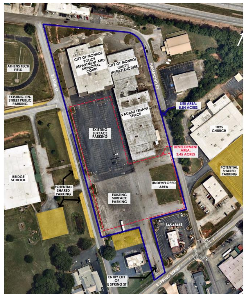
Figure 2: Existing Conditions and surrounding land uses, including potential off-site parking.

Commission recommended approving the "Blaine Station Master Plan" and rezoning the property from B-3 commercial to PCD (Planned Commercial District). Rezoning was approved by the City Council in November of 2021 and enables the property to be redeveloped for a mix of rehabilitated commercial/retail space, new construction on commercial out-parcels, and housing.