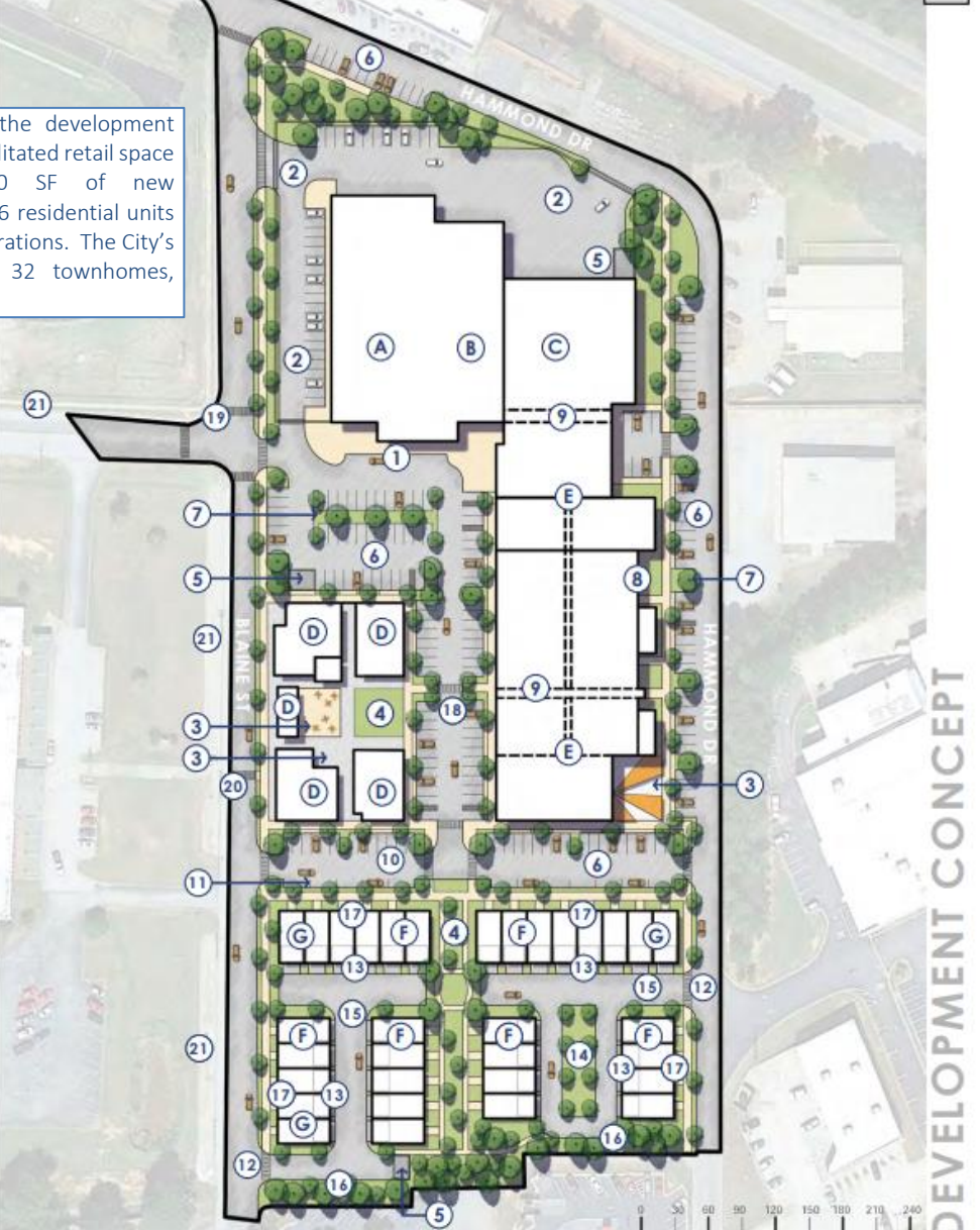
Figure 4 : In addition to municipal services, the development concept plan accommodates 46,300 SF of rehabilitated retail space in existing buildings, 12,000 to 24,000 SF of new commercial/retail/mixed use space and 28 to 56 residential units in multi-family, mixed-use or townhome configurations. The City's "preferred" concept illustrated here shows 32 townhomes, including potential live-work units.