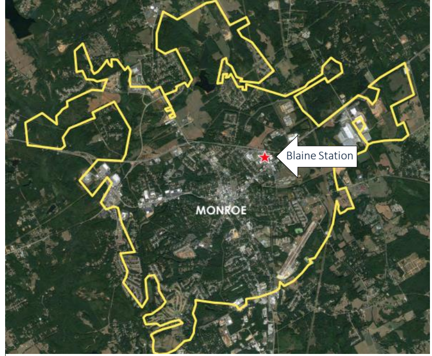
Figure 1: (above) Project location and Monroe city limits (below) approximate site boundary and nearby points of interest.

The City of Monroe greatly appreciates your interest and looks forward to the possibility of receiving your proposal. We also welcome the opportunity to answer your questions and provide any additional information you may need to respond, in accordance with the process described herein.