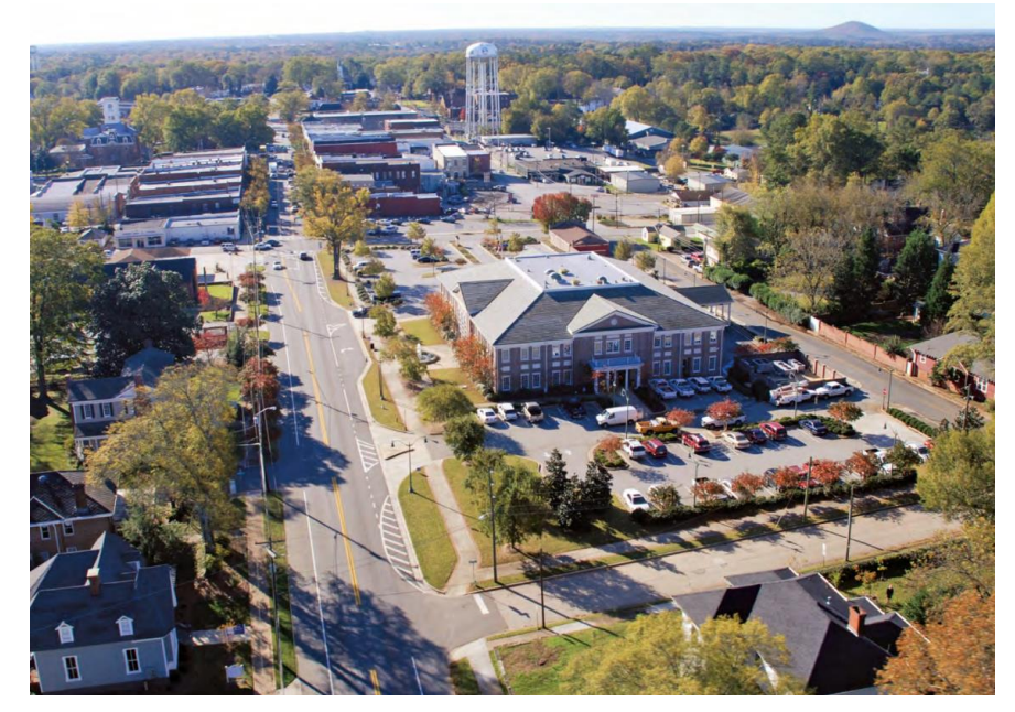
Figure 7: Downtown Monroe, 1.0 miles southwest of Blaine Station.

Monroe has an estimated population of roughly 15,000, located in Walton County. Monroe is situated along GA Highway 78 roughly 20 miles east of Snellville in eastern Gwinnett County, 26 miles southwest of Athens and the University of Georgia, and 15 miles north of Interstate 20 at Social Circle. According to the U.S. Census Bureau, Walton County's population has been growing at a 1.6% annual rate since 2010, significantly above the State average, and reached nearly 99,900 as of July 1, 2021. The estimated 2020 median income of 32,100 county households was estimated $65,500, nearly 7% higher than the statewide median, while the County's poverty rate was 2.6 percentage points lower than the state average.