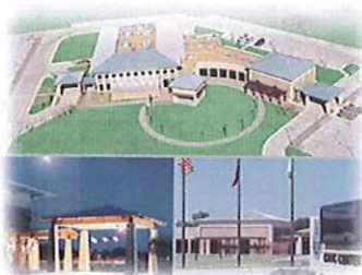
Decatur Civic Center